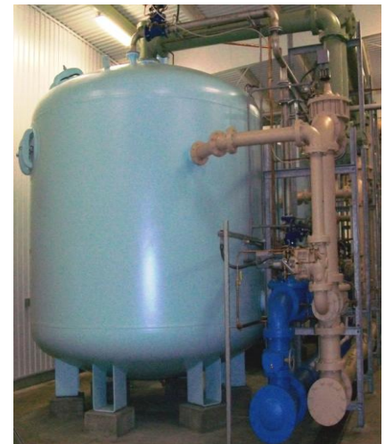
Typical Vertical Pressure Filter

Co-precipitation involves the entrapment of arsenate within growing iron precipitates or adsorption of the arsenate to the ferric hydroxide particles. This process works since arsenate exists as negatively charged ions that are attracted to the ferric hydroxide particles. For co-precipitation to occur, iron must be present in sufficient amount, with an iron to arsenic ratio of 20:1 or greater with the pH less than 7.5. This means that for every 1 ug/L arsenic, at least 20 ug/L iron is needed for co-precipitation. Note that optimum removal of arsenic will occur when iron and arsenic are oxidized at the same time. If iron is not naturally present in sufficient quantities, provisions need to be made for the addition of a ferric salt, such as ferric chloride, which will create a ferric hydroxide floc for arsenic co-precipitation.