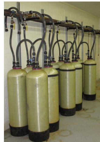
Typical Ion Exchange Cylinder System

Ion exchange is a treatment process that operates through exchange of ions in water with ions from an insoluble, permanent, solid resin bed. The resin media selected is dependent on the contaminant to be removed. Media beds are either positively or negatively charged to provide cation or anion exchange. Ion exchange media can remove both arsenite and arsenate but selection of the media will depend on the form present in the water supply. Over time as water flows through the resin bed, the media becomes exhausted and must be regenerated or properly disposed of as either a solid or hazardous waste. Ion exchange requires minimal operator attention and no backwashing. A smaller footprint may be possible as compared with conventional pressure filtration. Ion exchange has high resin replacement costs making it inefficient for larger facilities; however, this process may be economical for a very small facility due to the low labor costs. An evaluation would be needed to compare the capital, operation and maintenance costs, including labor and the cost to replace the resin.