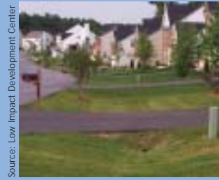
Grassed Swales Somerset Development Prince George's County, MD