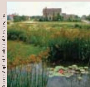
Wetland System Prairie Crossing Grayslake, IL