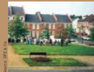
Bowman Park Vermillion Community Vermillion, NC