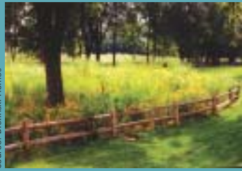
Community Open Space Bielinski Homes Waukesha, WI